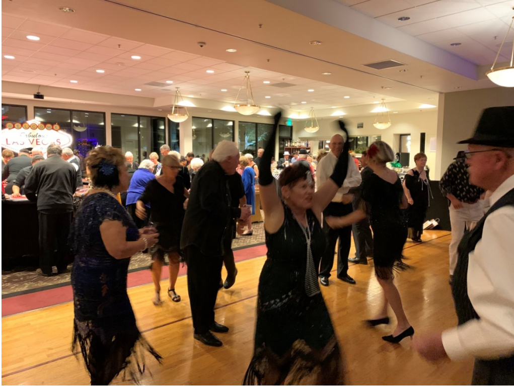
The dance floor was crowded all night.