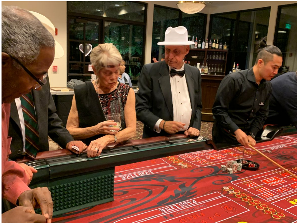
The gaming tables got a lot of action from ell-dressed gamblers.