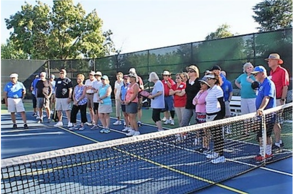
2019 PickleUp participants get their first briefing before their first of six lessons.

In July, the Club held its second very successful PickUp program. More than 20 volunteers under the direction of Joe Spada patiently tutored about 25 pickleball newbies in everything from the rules to advanced play. Several of the new players continued to play in the club's regularly scheduled events.