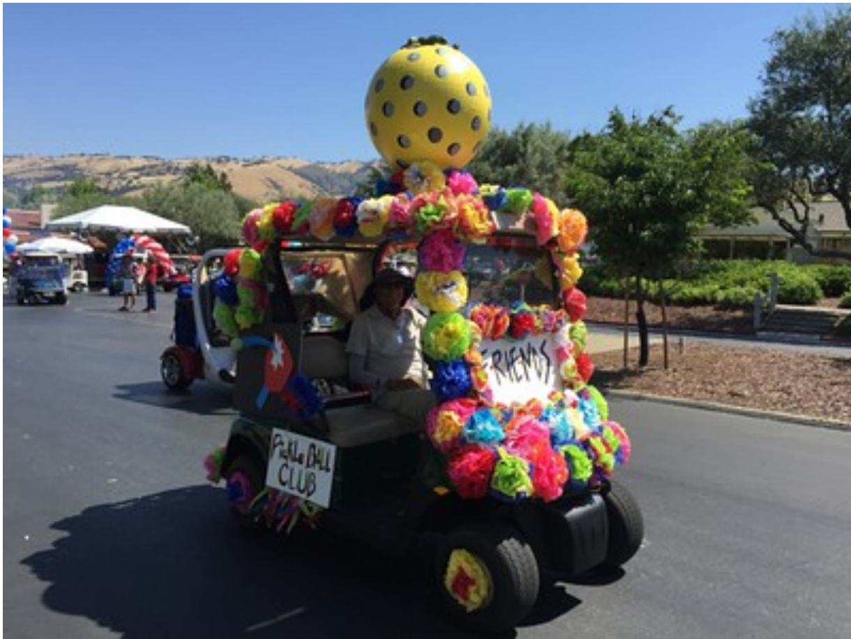
Our Fourth of July parade float was gaily bedecked, and volunteers played the game as they walked down the street.